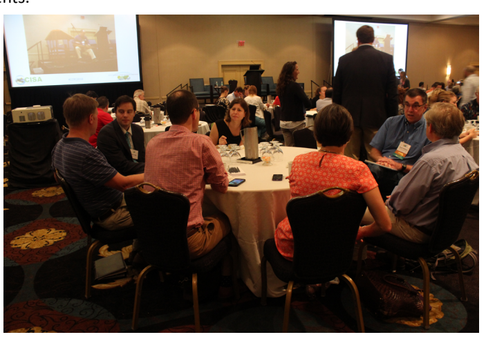
Participants at the Carolinas Climate Resilience Conference have ample time for networking and discussion, to share their own experiences and learn from others working to solve our most pressing climate-related issues in the Carolinas.